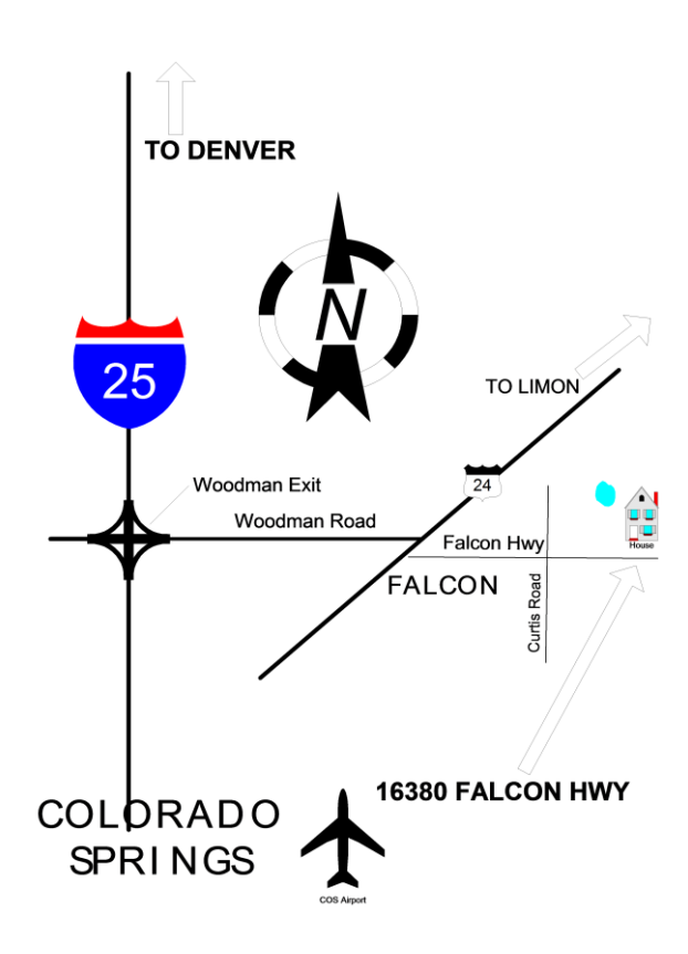
From I-25 North or South: Take Woodmen Road Exit and travel east to Highway 24. Turn Right on Highway 24 and then turn Left on Meridian. Go to stop sign and then Turn Left on Falcon Highway. Turn Left in drive way at 16380 Falcon Highway.